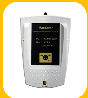
MacSolar Sensor (Front)